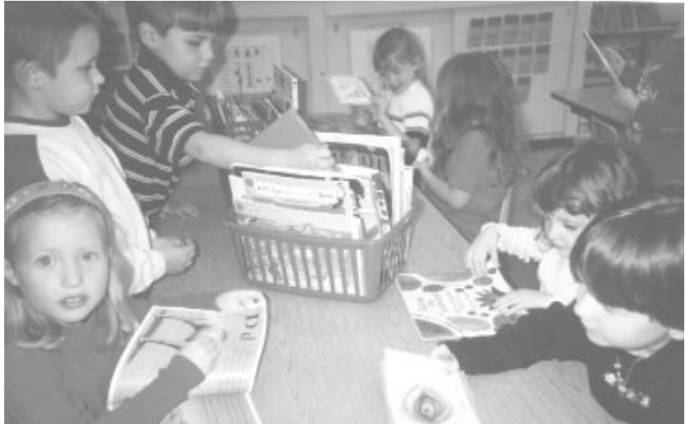
Beginning the day with free choice reading instead of worksheets

Many teachers walk around the room informally assessing students, both by “listening in” and by making notes as students are reading. Other times, teachers deliberately sit down next to students to observe them read, take anecdotal notes, guide students forward, give encouragement, set new goals, and celebrate successes. Some teachers are very deliberate about this assessment, seeing four or five students each day, dividing their class into Monday’s children, Tuesday’s children, and so on. Expert teachers observe what the child is already attempting to do as a reader and build on that rather than focus on deficits.